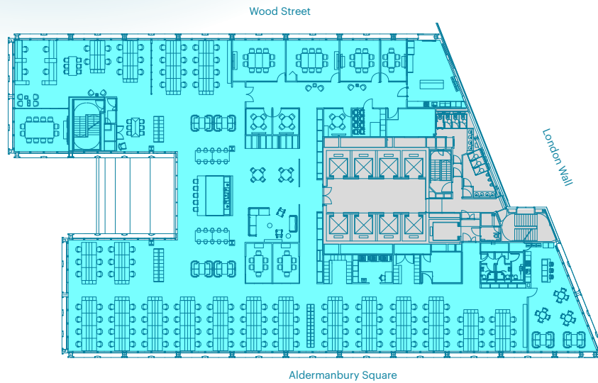
2nd Floor Plan - 14,766 Sq Ft (1,371.8 Sq M)